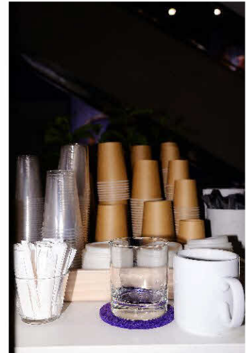
PLA und Papbecher auf dem G 20 zum erstmalig in Deutschland.

recognize the ozone hole over Hamburg which makes it difficult to photograph.